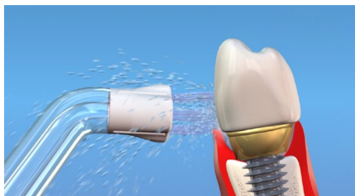
Figure 4: Plaque Seeker® Tip.

One of the downsides for patients using interdental brushes is replacing them on a reasonably frequent basis. A welcome addition to their homecare would be the use of an ancillary aid that would not require replacement. Magnussen et al. 30 looked at the combined use of manual brushing with either a Waterpik® Water Flosser with the Plaque Seeker® tip or traditional flossing to reduce the bleeding on probing (BOP) index around dental implants. In a 30-day single-blinded study performed at a single center, these authors demonstrated that, after the study, 81.8% (18 of 22) implants in the water flosser group showed a reduction in BOP compared to 33.3% (6 out of 18) in the floss group—demonstrating that the use of a water flosser might be a reasonable adjunct to manual brushing to clean around a dental implant compared to traditional flossing.