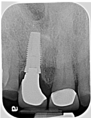
Figure 5: Although esthetic and functional, this restoration requires extra care for maintenance.

Data for cleaning single implants or a bridge is very different from cleaning implants designed to retain an implant that is either removable for cleaning or nonremovable (Figure 6). The latest introduction to the Waterpik® tip designs is the Denture Retained Implant Tip (Figure 7), which allows access below the denture prosthetics and the implant interface.