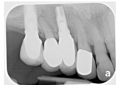
Figure 1: Radiographic bone level after case completion.

Although the decrease/elimination of this biomarker's values suggested that the resumption of oral hygiene eliminated the disease, the clinical appearance of the areas with mucositis, compared to the teeth with gingivitis, never went back to pretreatment appearance. Why this is the case is not understood.