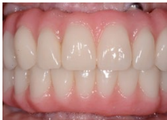
Figure 6: Screw retained maxillary and mandibular full denture.