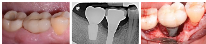
Figure 3a,b,c: Peri-implantitis around mandibular 1st molar seen clinically, radiographically and surgically.

For decades, dentists who have either placed or restored dental implants have pursued treatment for these two conditions predicated on the belief that these disease entities had but one etiology: bacteria. The general term “peri-implantitis” has often been applied to any implant with varying bone loss degrees beyond physiologic modeling/remodeling. In those cases where a baseline radiograph is absent, a threshold vertical distance of 2 mm from the expected marginal bone level (following remodeling post-implant placement) is the threshold for this diagnosis (Figures 3a-c). 20,21