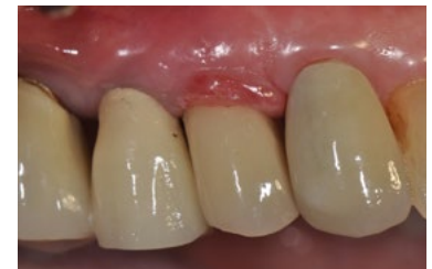
Figure 2: Peri-implant Mucositis.